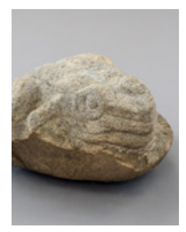
The Toad , c. 1960 Stone, gneiss 7" x 13" x 12"