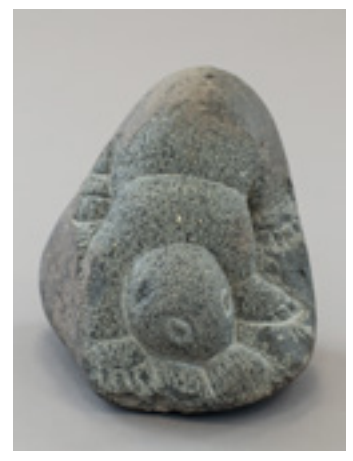
The Mole , c. 1960 Stone, gabbro 9" x 8" x 7"