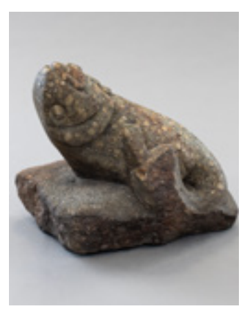
Sucker (Fish) , c. 1951 Stone, conglomerate 21" x 14" x 8.25"

At home, DiSpirito began transforming his backyard into a sculpture garden to exhibit his works. Neighborhood children and art curators alike were welcome. One visitor recalled the garden and the artist himself: "We were soon standing in a modest-sized yard filled with magnificent but simple stone creatures—animals, snails, insects. A man with white hair came out of the house and talked in a calm, but passionate voice. It was a stunning moment."