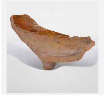
Pipkin base sherd with foot