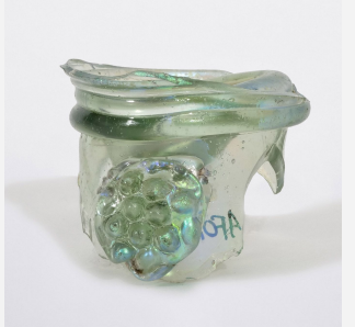
Roemer glassware bases with raspberry punts