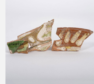
Slip-decorated utility ware sherds