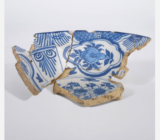
Shallow Delft bowl