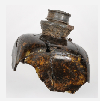
Dutch case bottle with pewter lid