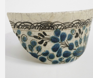
Spanish or Mexican majolica cup sherd