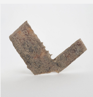
Tortoise shell comb